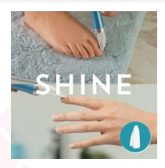
Step 3: Shine nails—instant natural looking shine.