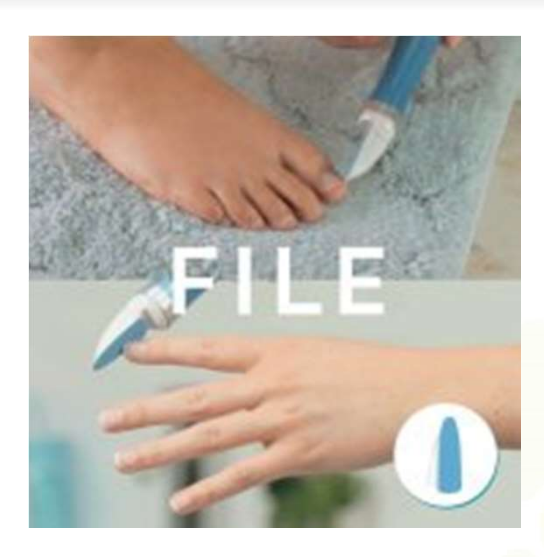
Step 1: File nails—allows filing and shaping to help prevent nail damage as recommended by nail experts.