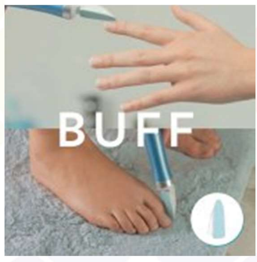
Step 2: Buff nails—to even out ridges and smooth the nail surface.